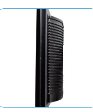
Side design, inclined design of main board compartment, and with more design sense