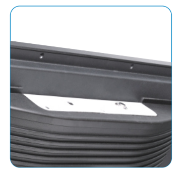
Power button on the top with seal design