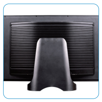
The main board compartment on the back is a whole metal plate design, and the whole plate heat dissipation design